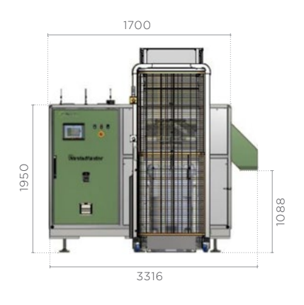
Front View Hatch fully opened and bin lifter presented